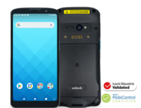
EA630 Plus Android 12 6" Rugged Smartphone