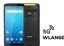
EA660 Android 13 6" Rugged Smartphone