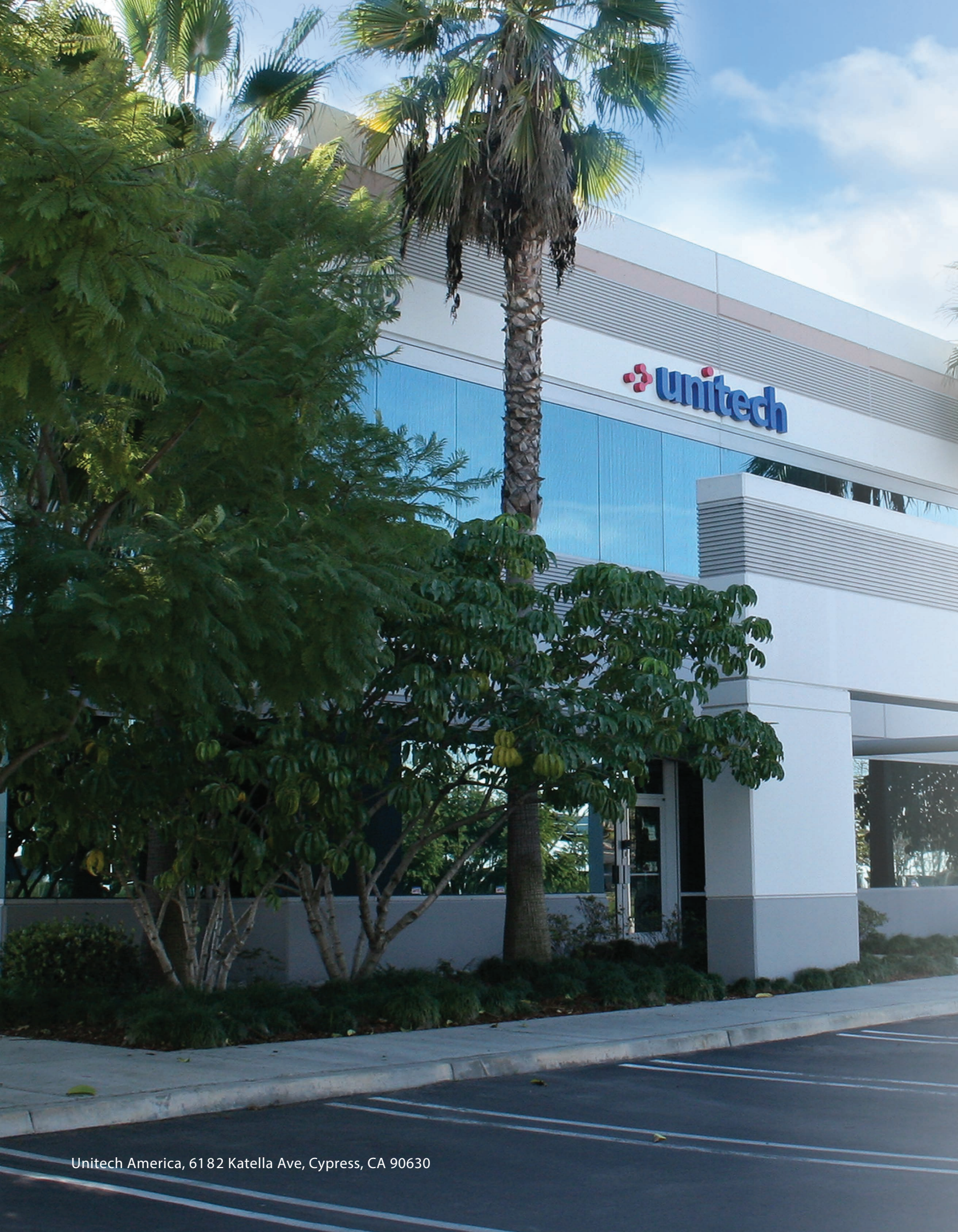
Unitech America, 6182 Katella Ave, Cypress, CA 90630